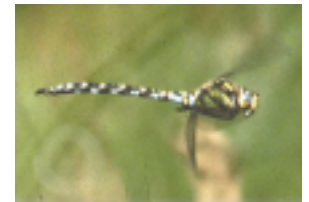
Southern Hawker Aeshna Cyanea

Located within the old colliery yard to the east of the River Doe Lea is an area of derelict land commonly known as Snipe Bog. This area contains two small ponds, reedbed and carboniferous limestone embankments colonised by rare calcareous plant species. With ecological advice from Derbyshire Wildlife Trust, Groundwork Creswell have improved access to this area whilst maintaining these diverse habitats.