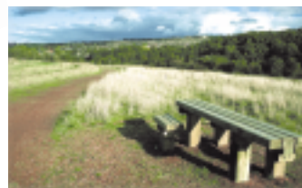
Peter Fidler Reserve Former Bolsover South Tip

Stockley Trail, Carr Vale Flash and most of the Peter Fidler Reserve provide a number of fully accessible routes and facilities for a wide range of user groups. Some physical constraints do exist but slopes have been eased where possible to improve access. These facilities were designed in conjunction with Access Bolsover.