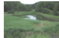
This is the new reed bed created at

In the summer Dragonflies are on the wing in the Peter Fidler Reserve. Watch over the new pools for these fascinating insects. You will see Emperor, Brown Hawker, Common Darter