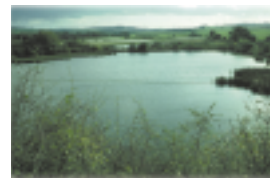
Carr Vale Flash Nature Reserve