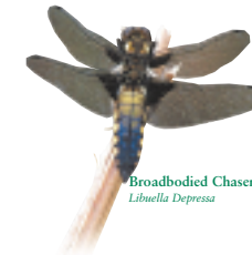
Broadbodied Chaser Libellula Depressa

These habitats attract a variety of wildlife. In spring, plovers and several species of duck come to breed. In winter, large flocks of Lapwing, Golden plover and gulls use the site. The meadow areas are also popular with butterflies and the pools attract dragonflies such as Black Tailed Skimmers and Broadbodied Chaser. Walkers access only from Stockley Trail and Peter Fidler Reserve.