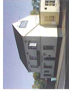
The Wheel public house