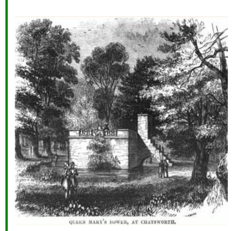
Queen Mary's Bower Then

"Oh, soon to me may summer suns Nae mair light up the morn! Nae mair to me the autumn winds Wave o'er the yellow corn! And in the narrow house of death, Let winter round me rave; And the next flowers that deck the spring, Bloom on my peaceful grave." Historic image by unknown author.