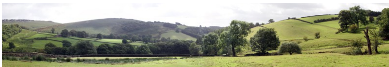
View From Green's House.

Leave the car park and turn left onto Oddfellows Road, walk up past the fire station on until the road bears right, ahead the footpath becomes a narrow passage between a garden wall and a house. Walk pawn the passage to the road, cross the road and continue into Baulk Lane to the right of the walking gear shop (The Square). Follow Baulk Lane for a little over a quarter of a mile, ignoring the footpath signs to both right and left. After crossing a cattle grid the surface becomes rougher underfoot, a short distance later the track swings to the right and rises for a short distance before resuming it's original direction as a grass track.