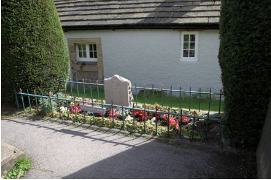
Little John's Grave St Michael & All Angels, Hathersage.

At the cattle grid the footpath seems to continue to the right of the fence, on the day I was there it looked more like a mud bath than a path, so I followed the roadway down the lane (both seem valid paths on the OS map). Should you choose take the mud bath path it will eventually re-join the lane through a metal kissing gate.