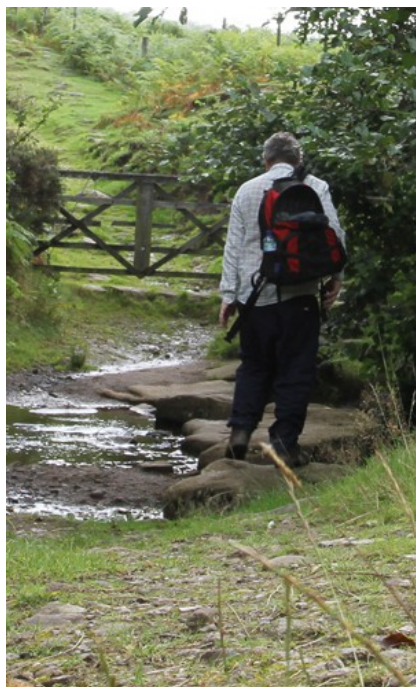
Stepping Stones Over Hood Brook

One of the more demanding walks on this site even though it is only 4.5 miles long. If you are thinking of doing this walk please take into account that there is very little walking on the level, and that a large portion of the later section of the route is totally exposed to whatever the weather, so as with all walks please be prepared and if you have any doubts about the weather leave this walk for another day. Having said that the views down the valley from Green's House, and Stanage Edge from the road on Cattis-Side Moor make this walk well effort worth Effort. As a bonus for those stepping stone lovers amongst you, there is a set on this walk. One final thing to look out for as the route passed through the church yard of St Michael and All Angels is the grave of "Little John" the quarter-staff wielding companion of Robin Hood.