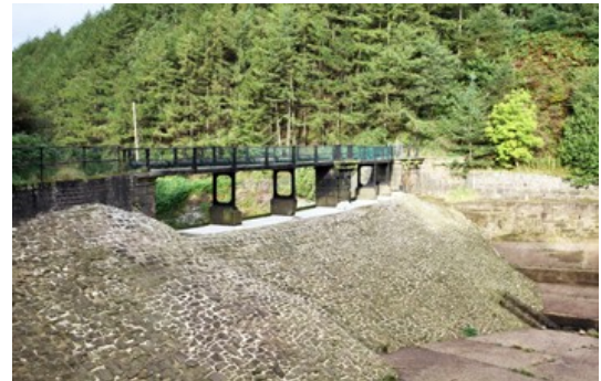
Footbridge Over Woodhead Dam Sluice

Woodhead Dam, then take the foot over the run-off. On the other side of the footbridge go down the set of steep stone steps on the left and follow the footpath towards Torside Reservoir. Follow the path beside the sluice until it bears right away from the reservoir to a small stone bridge. The path over the bridge leads to Crowden car park; the alternate start point for this walk. Do not cross the bridge, instead follow the path until it reaches a gate then take the path to the left (signposted Torside Dam) and head back towards the reservoir. On reaching the bank of the reservoir the path crosses a wide concrete bridge over Crowden