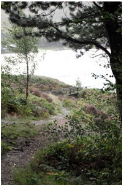
Tinsel School Wood.

Brook then narrows to a track with bracken on both sides. At one point along the way there is a wooden barrier to the left of the path, if you have children or animals with you have them under close supervision at this point as there is an almost sheer drop into the waters of Torside reservoir. Keep following the footpath until it reaches a metal footbridge over the sluice, cross the bridge and take the path up the slope into Tinsel School Wood. The path now continues to rise gently as it passes through woodland and areas of bracken, over a stile and a wooden bridge over a stream and through several gates until it enters an area of pine wood. As the path progresses through the pine wood it is joined from the right by the Pennine Way. The path along this stretch is often bordered by various mushrooms and toadstools, of the six I was able to identify five were poisonous, and to be honest I wouldn't fancy trying the sixth! The path eventually leaves the pine wood and drops away to the left down to Torside Dam.