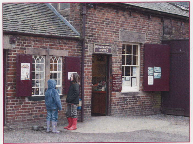
High Peak Junction

C At High Peak Junction you have the choice of adding on an extra loop to the walk to create a slightly longer walk. The longer one involves a pleasant walk along the Cromford Canal and past the former home of Florence Nightingale.