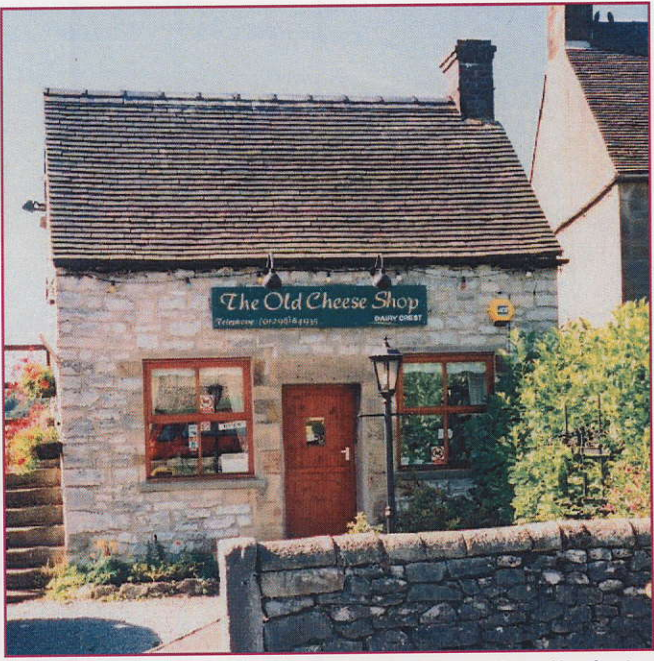
The Old Cheese Shop, Hartington

At the signpost to Hartington, turn left through a gate and across a field, then over the river by a footbridge. The path crosses fields, aiming for the woods to the left of the dairy buildings and enters them via a stile. Go into the forecourt of the dairy and turn left along the lane back into the centre of Hartington.